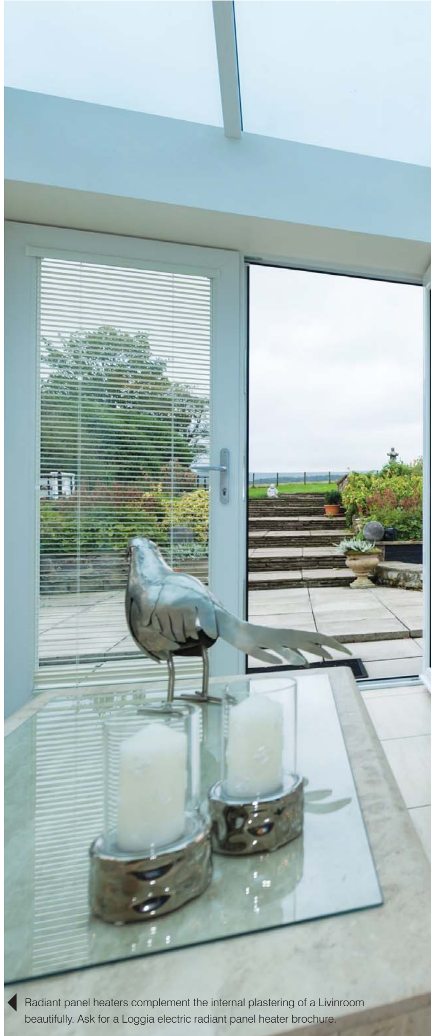
◀ Radiant panel heaters complement the internal plastering of a Livinroom beautifully. Ask for a Loggia electric radiant panel heater brochure.