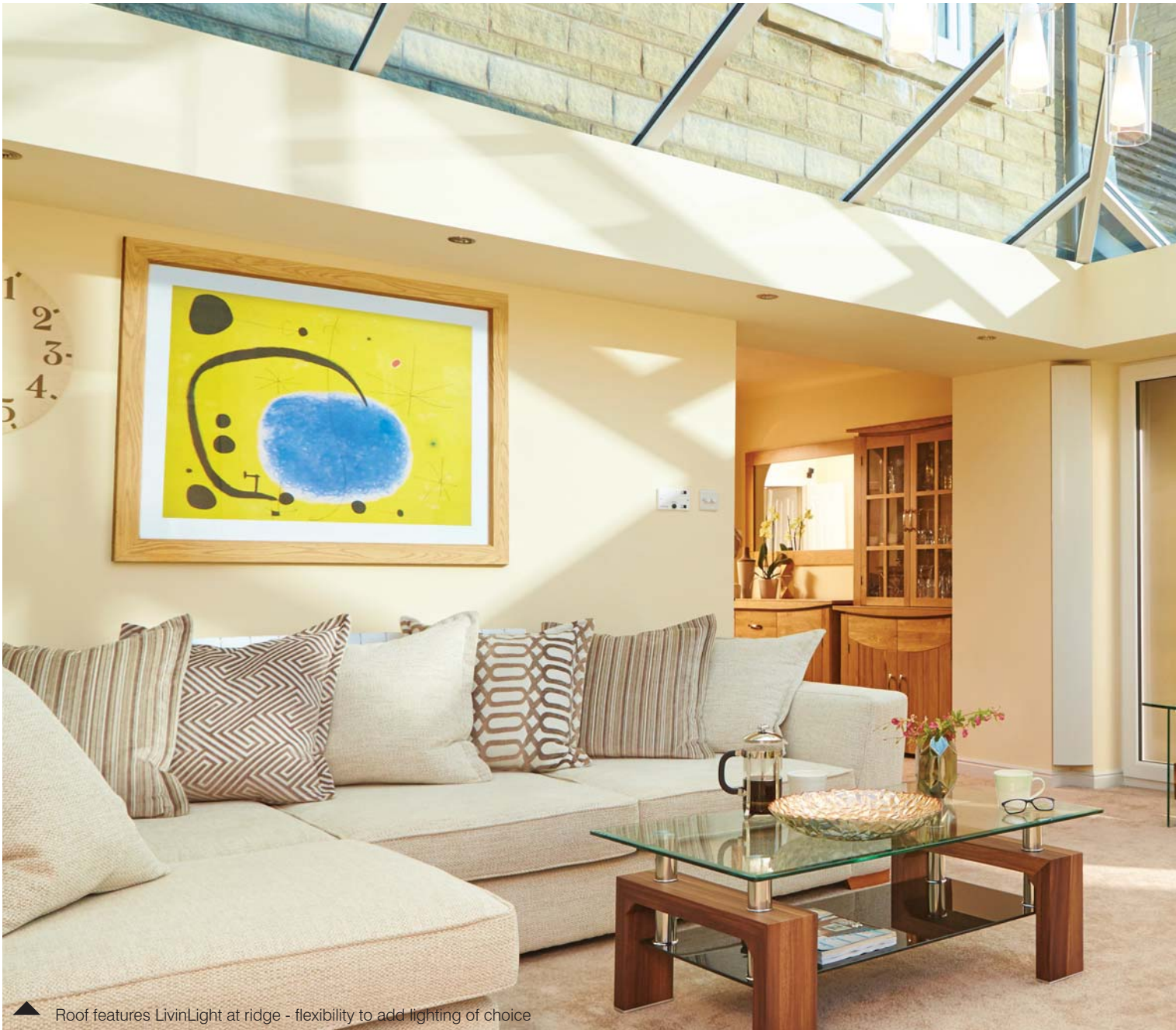
▲ Roof features LivinLight at ridge - flexibility to add lighting of choice