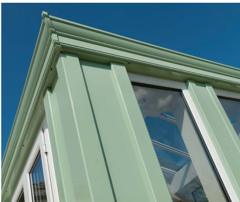
Cornice can be used with brick columns or with super insulated Loggia columns ▲

Change the visual dynamics externally too by using Cornice for a smooth finish at the wall/roof interface.