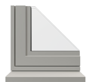
Agate Grey RAL 7038