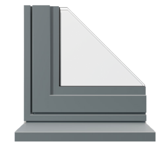
Squirrel Grey RAL 7000