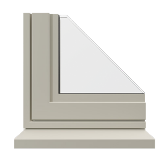
Cream RAL 9001