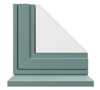
Pastel Turqoise RAL 6034

Available in eight powder coated, matt colours, with the option of choosing a different colour for the interior to help you find the look that is right for your property.