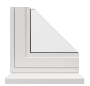
Pure White RAL 9010