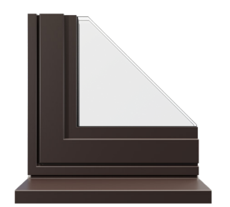
Chocolate Brown RAL 8017