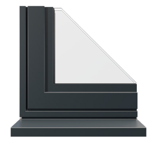
Anthracite Grey RAL7016