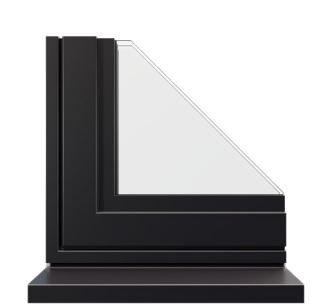
Jet Black RAL 9005