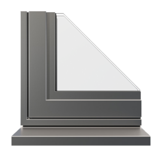
Natural Silver Anodised