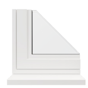
Hipca White RAL 9910